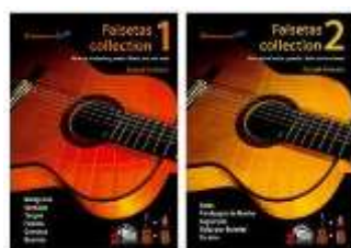
Saving Pack - Falsetas Collection