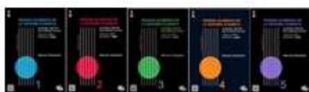
The Academic Treatise on Flamenco Guitar SAVING PACK (5 Books/CD) - Manuel Granados